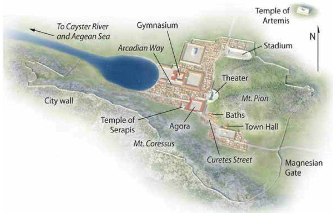
Ephesus in Paul's Time