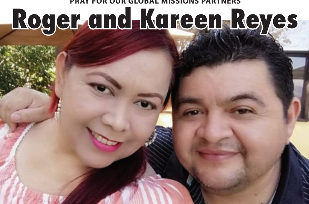
Church Planters | El Progreso, Honduras Humanity and Hope United Foundation | humanityandhope.org