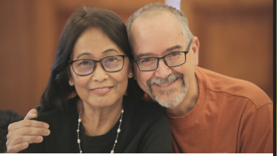
Mobilizers and Representatives | Iran Elam Ministries | elam.com