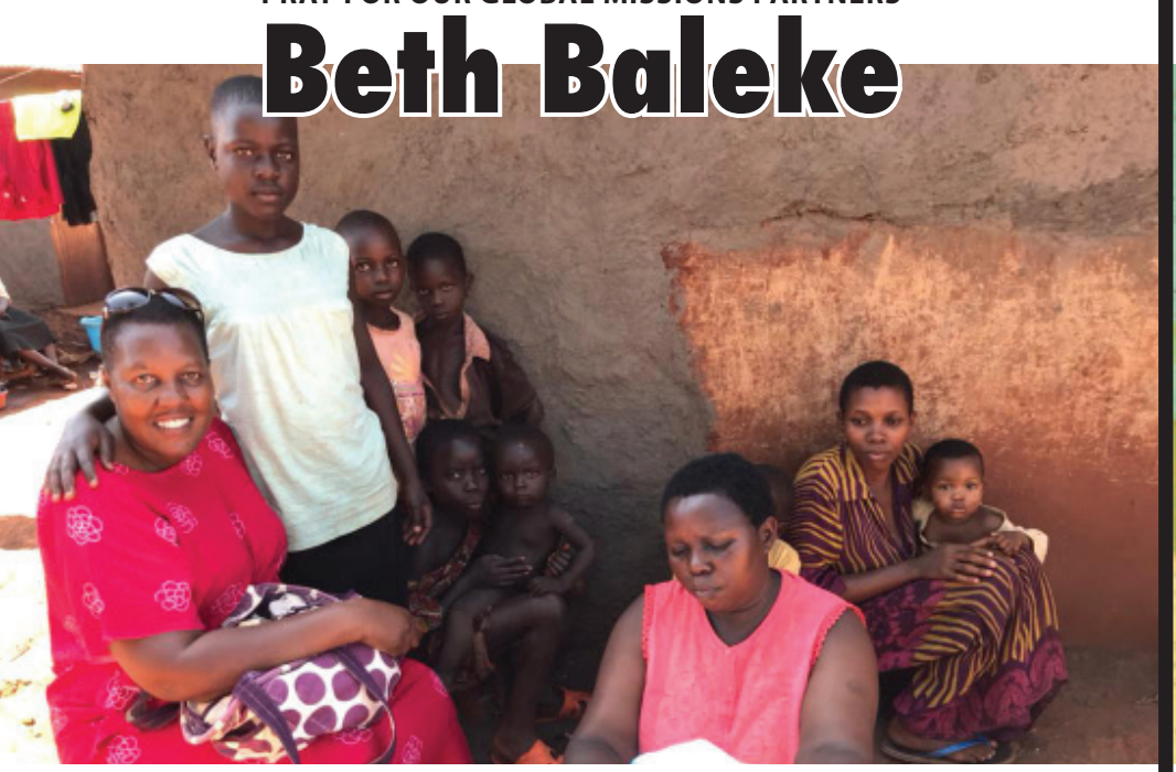
Missionary, Leader Development | East Africa Scripture Union of Uganda | scriptureunion.global