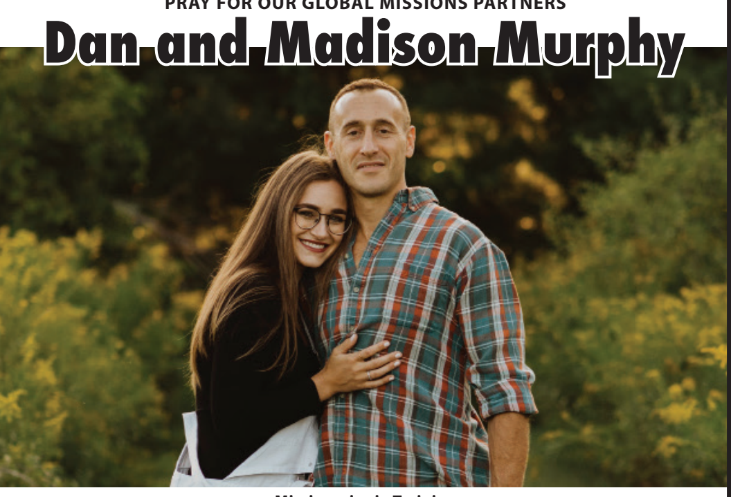
Missionaries in Training Ethnos360 | ethnos360.org