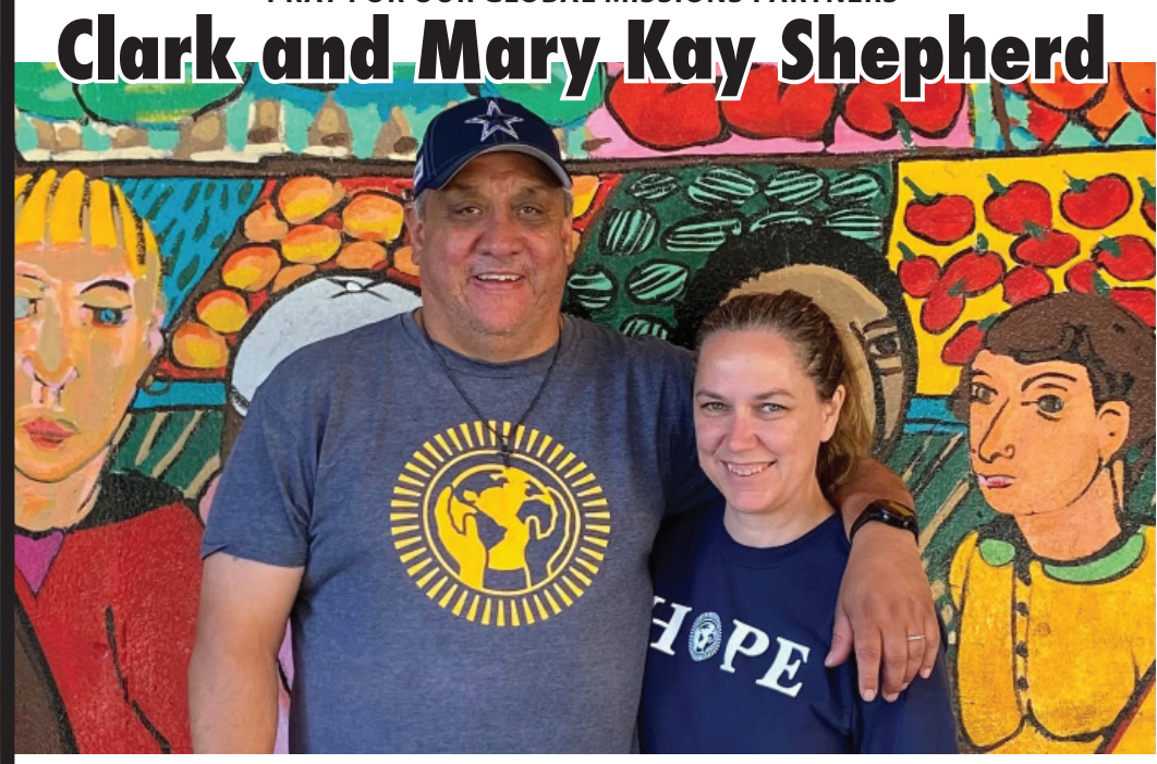
Founders | Allowing Christ to Shine (ACTS) | allowingchristtoshine.org Lafiteau, Haiti