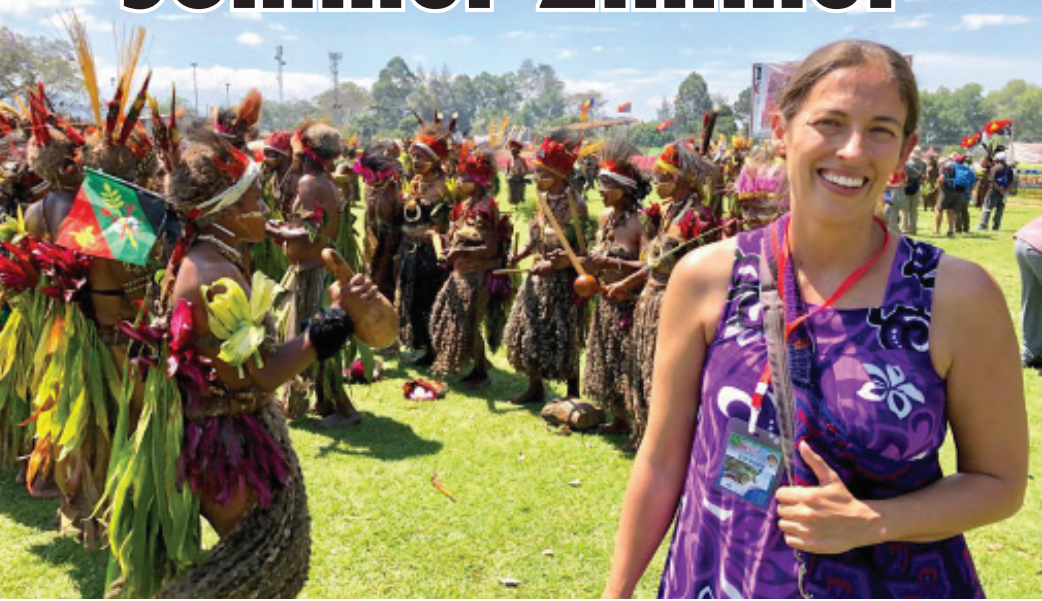
Communications Director | Goroka, Papua New Guinea Ethnos360/New Tribes Mission, Papau New Guinea | ethnos360.org