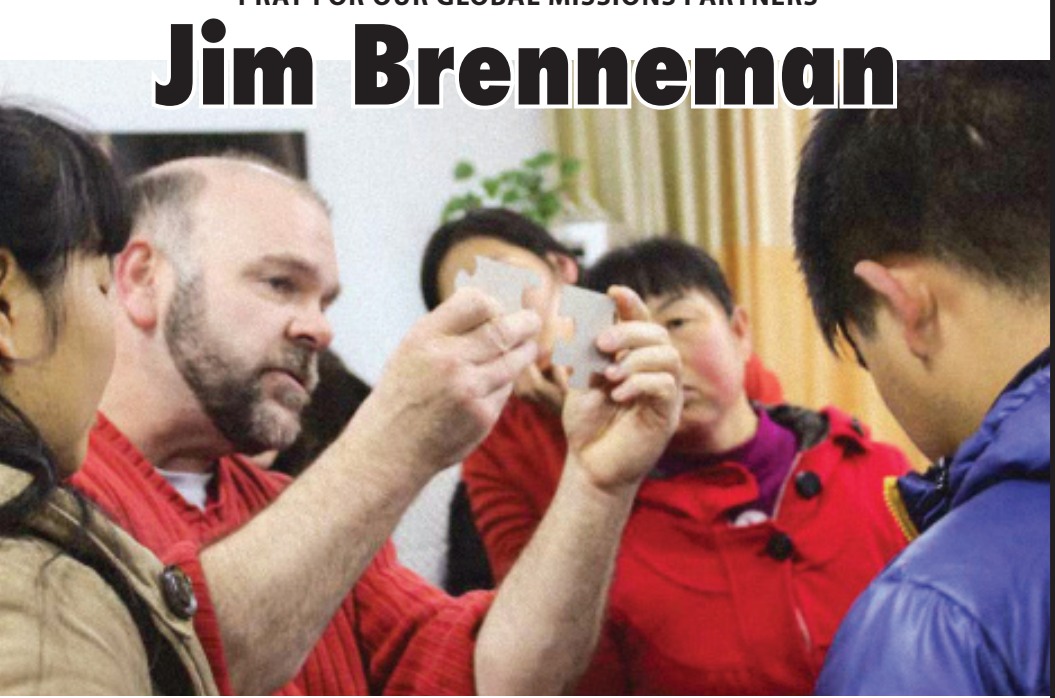
Coach, Mentor and Writer | China LeaderSource SGA | leadersource.org