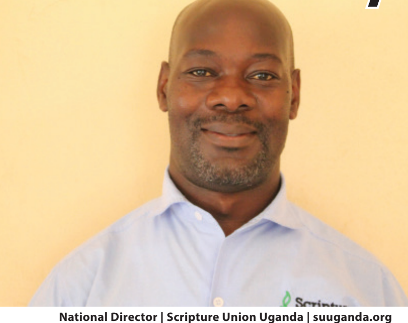
National Director | Scripture Union Uganda | suuganda.org Kampala, Uganda