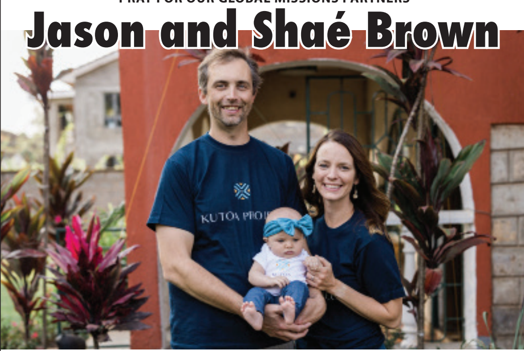
Founders | Kutoa Project | kutoaproject.org East Africa, Kenya and Nairobi