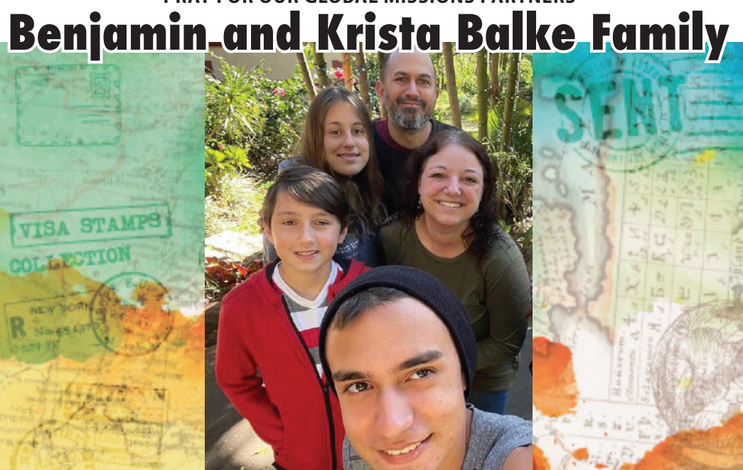
Missionary Debriefers and Oasis Hosts | Grecia, Costa Rica Life Impact Ministries | lifeimpact.care