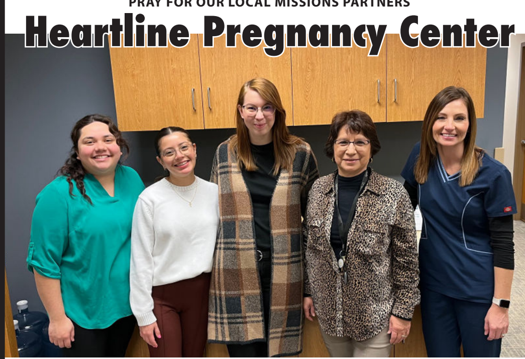
Heartline Pregnancy Center | heartlinepregnancycenter.org