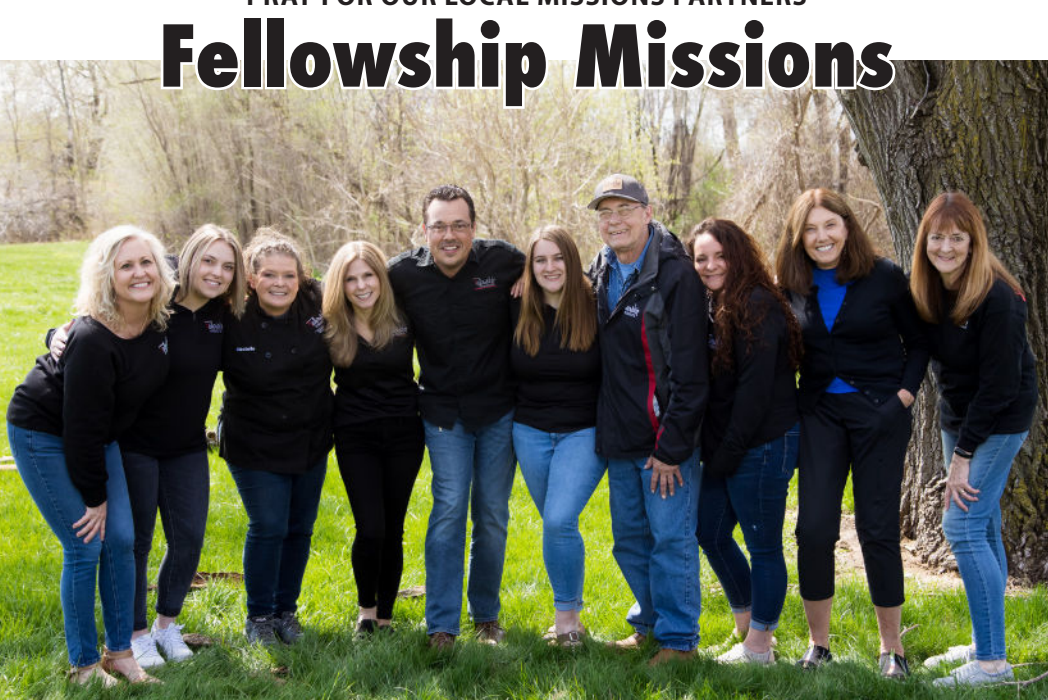
Fellowship Missions | fellowshipmissions.net