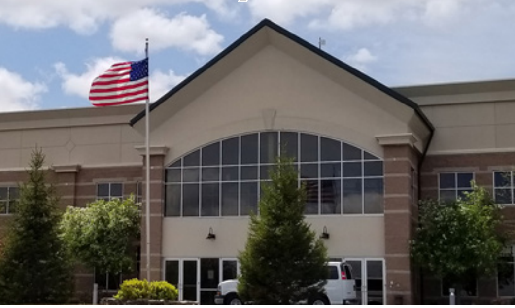
WCC Community Outreach Teams | warsaw.cc/serve