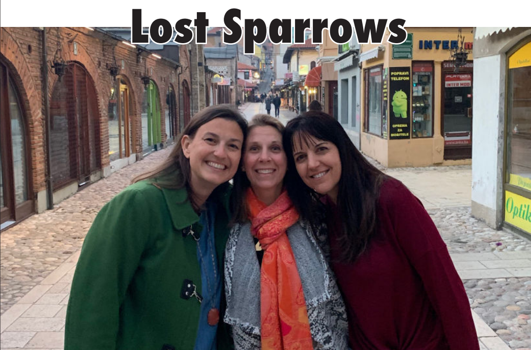
Lost Sparrows | lostsparrows.org