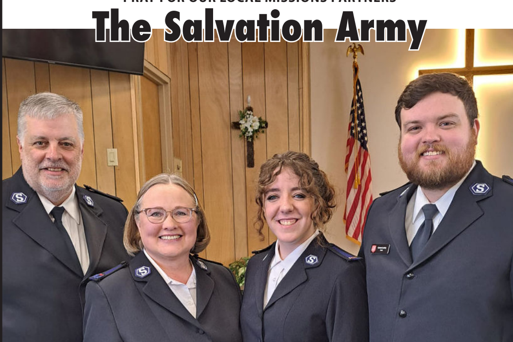
The Salvation Army | centralusa.salvationarmy.org/warsaw