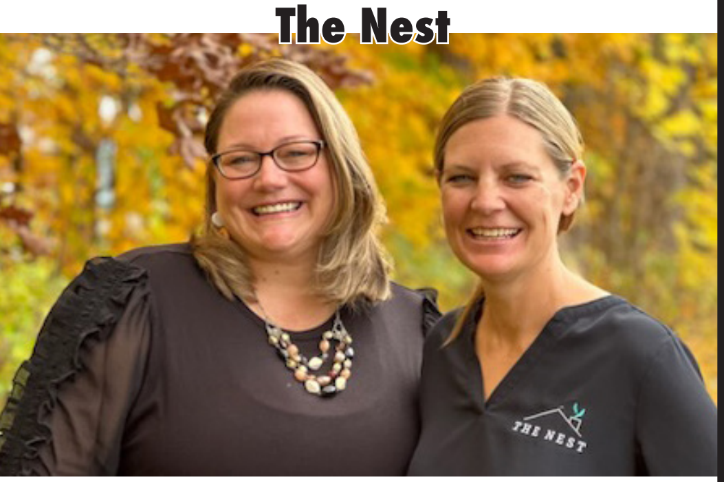
The Nest | thenestcares.org