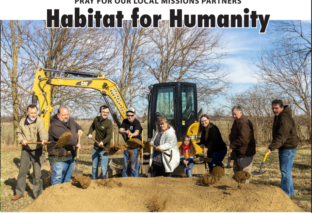
Habitat for Humanity | kosciuskohabitat.org