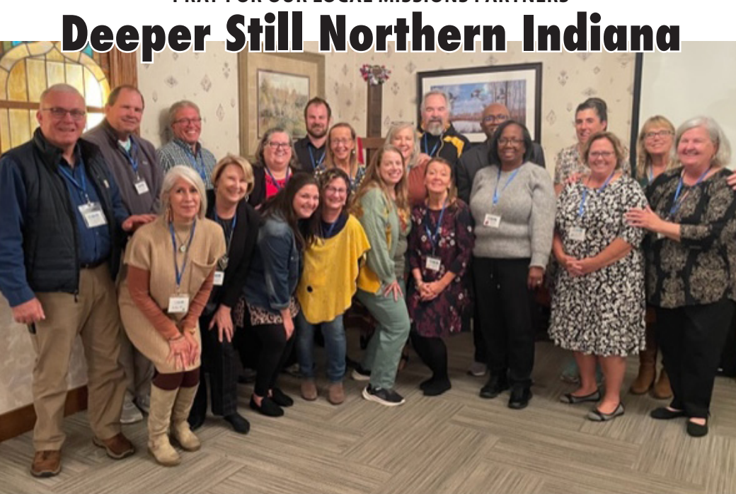
Deeper Still Northern Indiana | deeperstillnorthernindiana.org